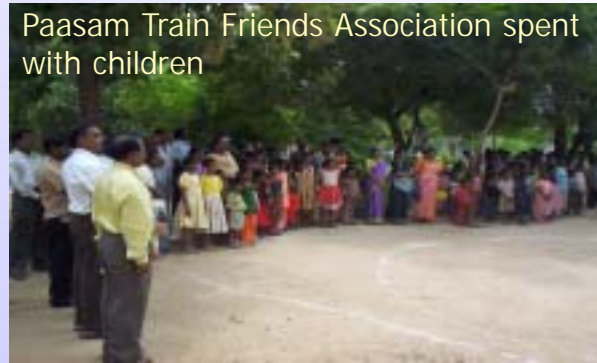
Paasam Train Friends Association spent with children

Our students participated in the District Level Athletic Meet .