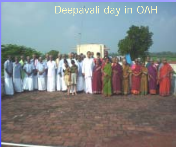
Deepavali day in OAH

Boys went to the temple at Ramanathapuram on 11/11/2005. The hostel girls went to the temple on 18/11/2005.