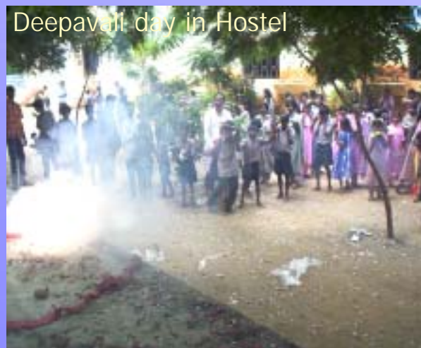
Deepavali day in Hostel