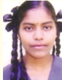
P.Amul 1014/1200 Seiyaaru